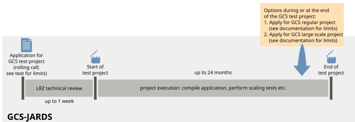
Figure 1: Example of the process for a test project with basic support