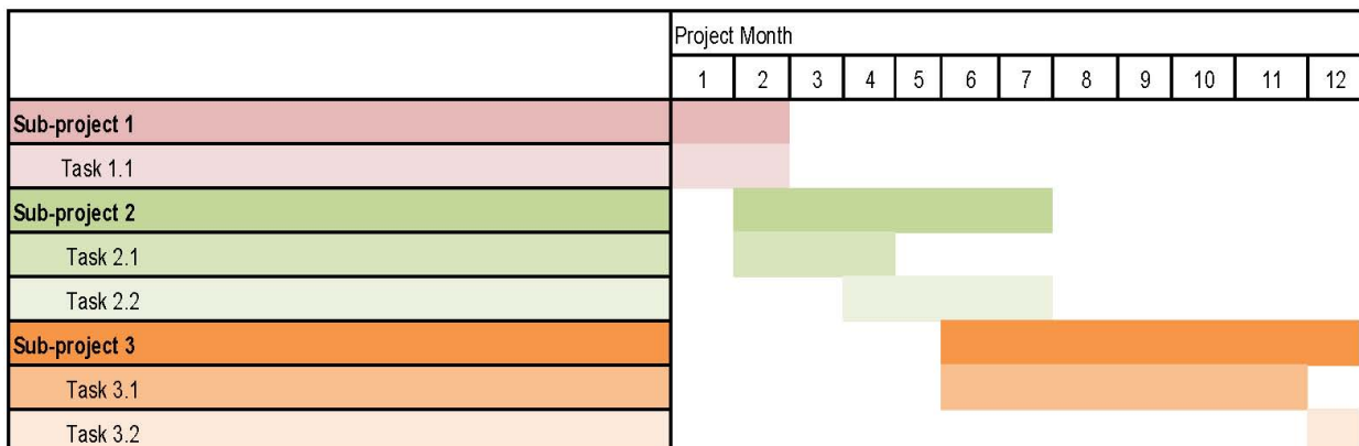
Figure 2: Work schedule for the project.